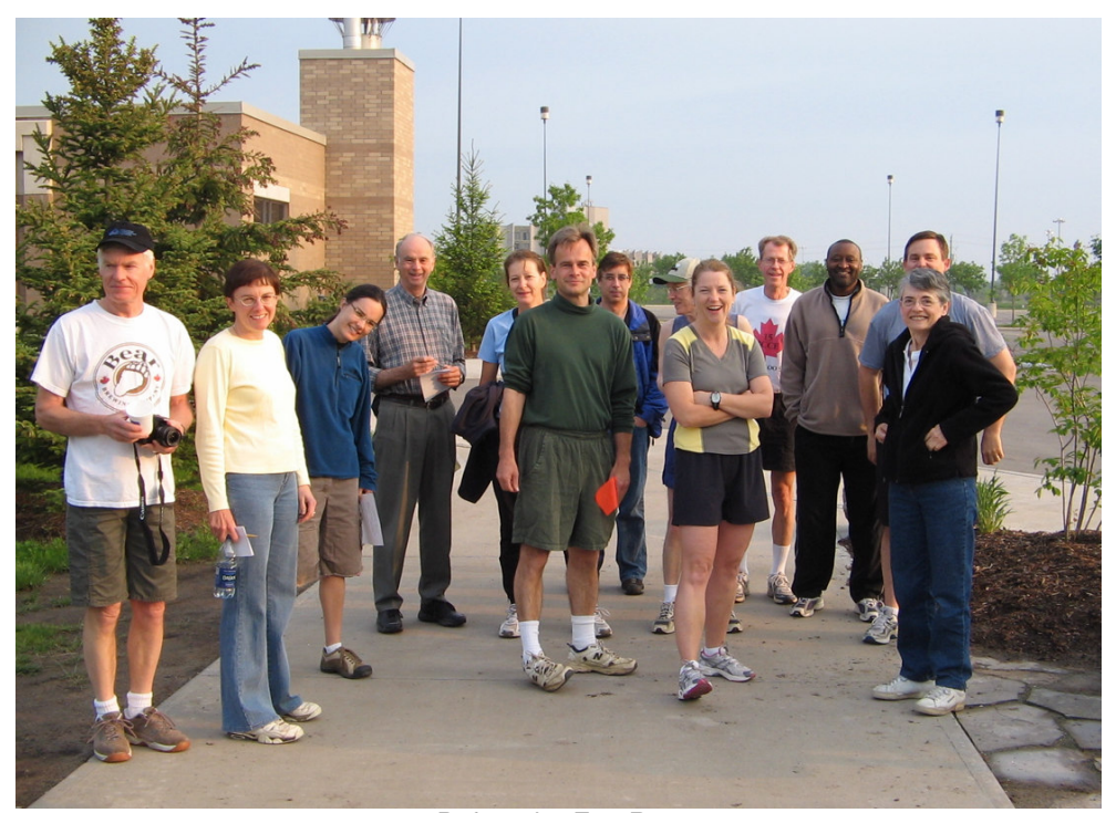
Before the Fun Run