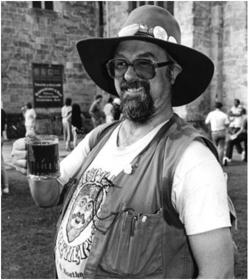
Salisbury (near Stonehenge)

He was born in Arundel, Sussex, in the days when the streets were still lit by gaslights, and where being born in the village makes him a "Mullet" (a rare breed, since most people had to go to a nearby town to be born in hospital). He developed a healthy attitude towards education at a very early age, regularly skipping primary school on Mondays in favour of excursions to London with a truck-driving father.