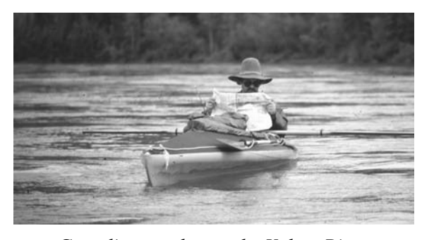
Guardian reader on the Yukon River near Little Salmon

Sports, travel, interests, hobbies? He likes to travel, especially in trains. Flying requires a window seat - or a seat next to the driver: he likes small planes, not the big tin tube. You can get from Spinnakers (Victoria) to the Granite Brewery (Halifax) in much better style on the train. He likes beer, but only good beer that strikes the palate the stuff with no after taste is not worth drinking. He walks everywhere at a modest cruising speed of 5 mph. He once walked a 500 mile pub crawl through Britain, where it's not likely to be 100 miles between pubs. His photographs speak of the New Forest and the Wye Valley, of the Stikine, the Yukon and the Tatshenshini. He has photographed highland cattle on the ocean beach at Calgary, and wild orchids at Fort McMurray, and he is better at setting puzzles than at solving them - although he does play a reasonable game of trivia. His Klepper has carried him thousands of kilometers around the southern lakes and on trips down the Yukon - no engines, please, it's better to hear the water and the wind in the trees. Travel is something that should be enjoyed.